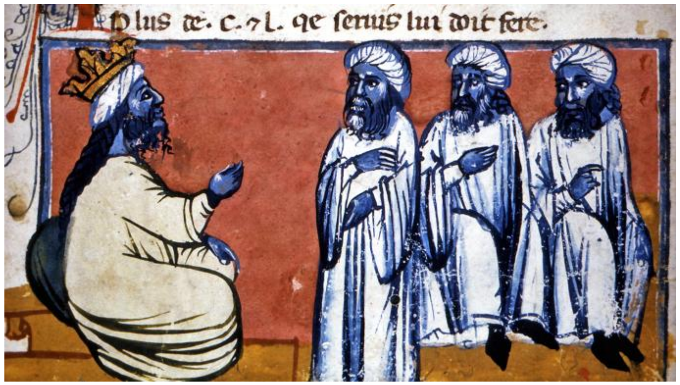
A 14th-century depiction of Boabdil, the last Moorish king of Granada Share Save